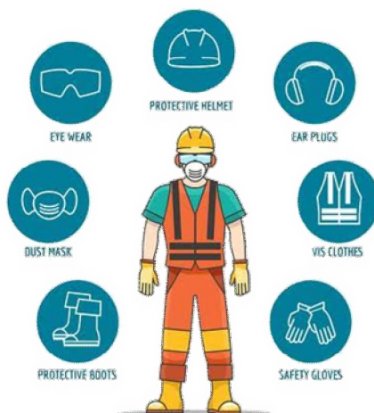
Fig.1.4.1 Personal Protective Equipment (PPE)

The PPE is a equipment that will protect workers against health or safety risk at construction project site. All the human present at site must wear the PPE and the Safety Officer or Safety In-charge has the responsibility that everyone use the PPE at site.