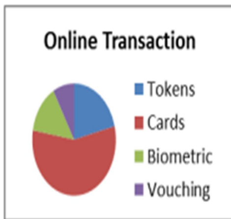
Figure 1: Online Transaction Authentication Methods in Use.

An online transaction is an activity that occurs from one computer to another in the form of a request and answer. The server responds to user queries instantly. The user also isn't present physically in front of the server; instead, the user connects with the server through a network connection. As a result, the user must be authenticated in order for the server to fulfill the particular user request.