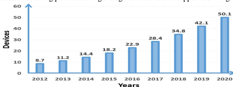
Figure 3: IoT Devices Connected within the policies areas