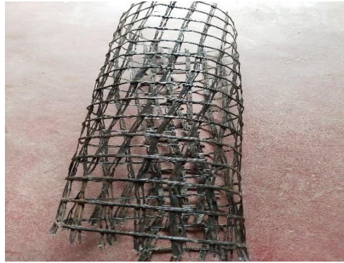
Fig. 1 Geogrid