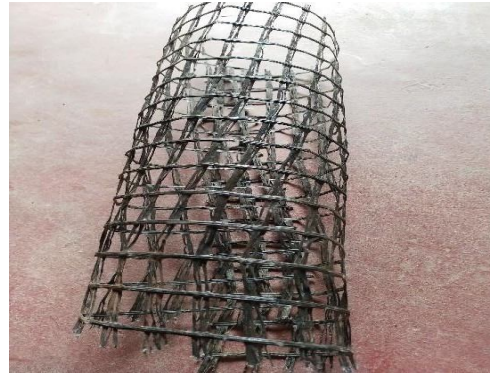
Fig. 1 Geogrid