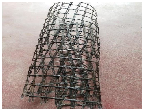
Fig. 1 Geogrid