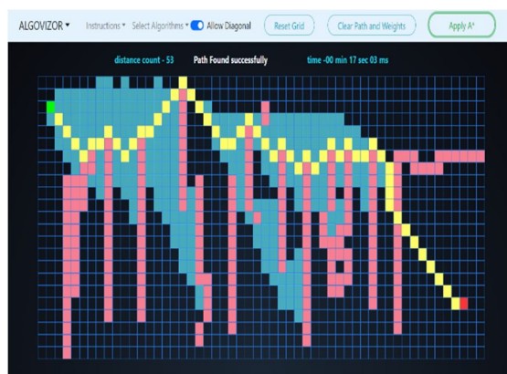
Figure 2 A* with Diagonal