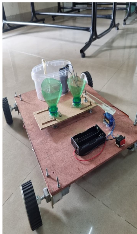
Figure 3: Bot Mechanism for seedinf and sprinkling