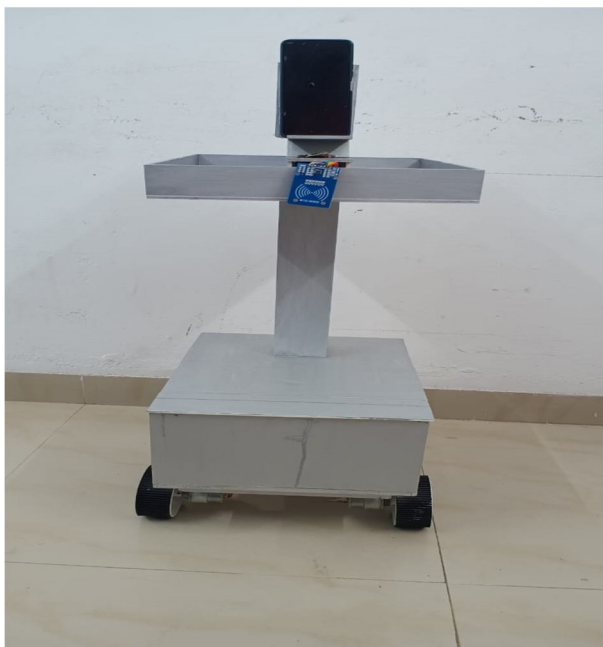
Fig 5 : Overview of model

Overall, the results of implementing SANAR underscore its transformative potential in revolutionizing healthcare delivery, enhancing patient care outcomes, and driving innovation in the healthcare industry. By leveraging robotics, IoT, and data analytics technologies, SANAR represents a significant step forward in realizing the vision of a more efficient, accessible, and patient-centered healthcare system.