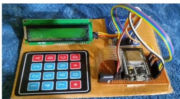
Fig.2. Final Setup

An RFID credit card is enabled with radio frequency identification technology. This enables your card to communicate with a payment terminal by using a radio frequency by replacing a magnetic strip. RFID cards allows you to simply tap or wave your RFID card near a card reader which provides much more security than any other creditcards.