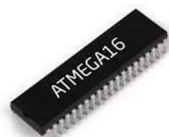
Fig2.4.-A AT MEG16