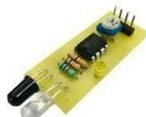
Fig.2.3-A IR sensor