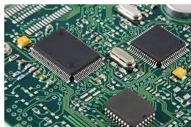
Fig.2.5.- A PCB Board