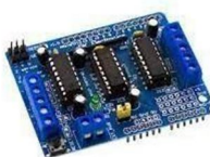
Fig.2.7- A L293D Motor driver