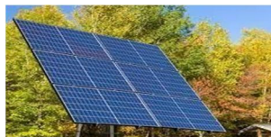
Fig2.9.- A Solar Cell