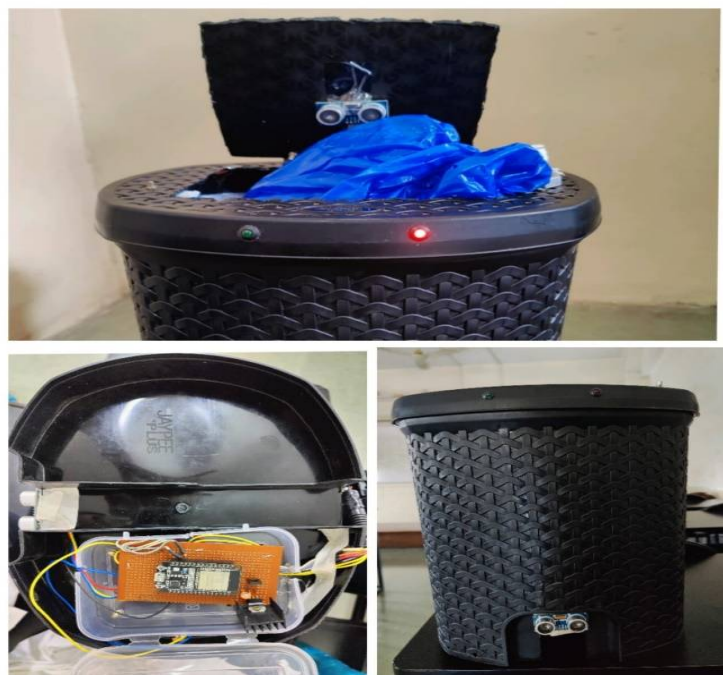
Fig. 4. Final Product