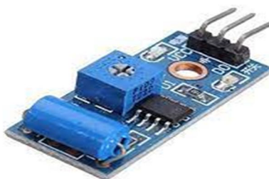
Figure4. Vibration Sensor