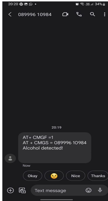
Figure5. Results for alcohol detection