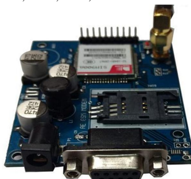
Figure3. SIM900 GSM Module