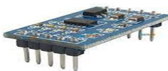
Figure 1. Accelerometer ADXL345