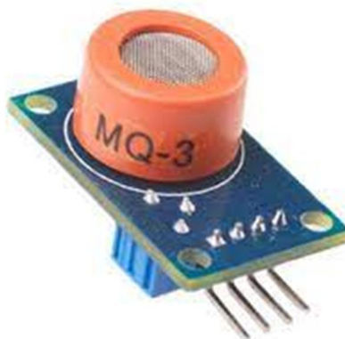
Figure2. MQ 3 Alcohol sensor