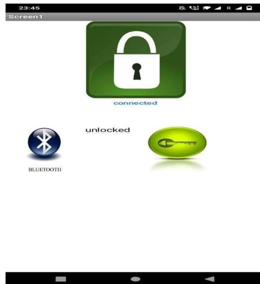
Figure 3: App Interface