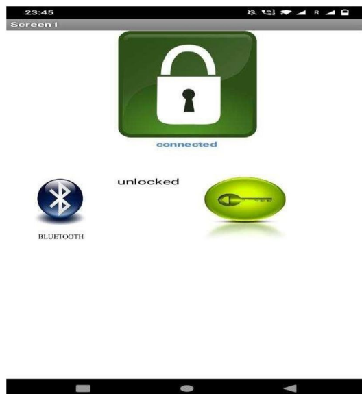
Figure 3: App Interface