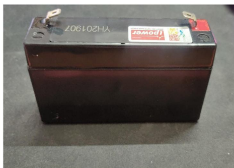
Figure 2. Rechargeable Battery

We have piezo plate and connected to a rectifier in a small test and connected a DC-DC converter (Buck converter or Buck-Boost Converter), then it goes to storage capacitor or a rechargeable battery. Finally, it gets connected to the load.