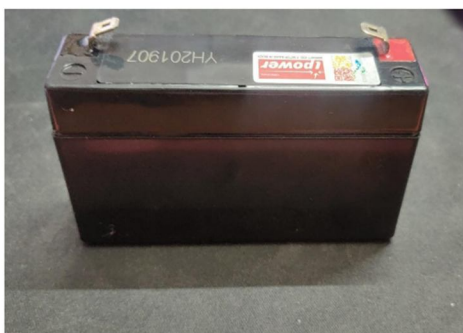
Figure 2. Rechargeable Battery

We have piezo plate and connected to a rectifier in a small test and connected a DC-DC converter (Buck converter or Buck-Boost Converter), then it goes to storage capacitor or a rechargeable battery. Finally, it gets connected to the load.