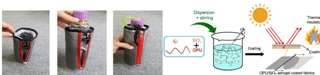
Figure 2. Aerogel Blanket

In the modern world, the economy of a product is paramount, as is the quality. The cost of a product depends on many different factors such as the process, materials and time taken to manufacture the product. Current models of thermos flasks are analyzed for efficiency and cost.