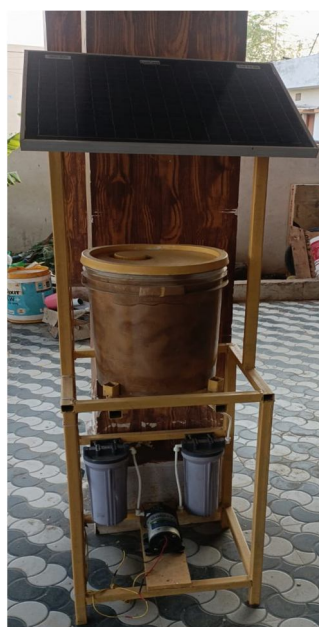
Figure 2 : Model of water based purification system