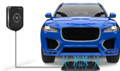
Fig-3: Static wireless charging system

Wireless charging system creates an different way to provide a eco-friendly environment for user and when plug-in charging system it prevent from safety related problems. The SWCS can easily replace the plug-in charging system with driver application and at the time of trip and electric shock it is able to solve all the safety issues. The primary coil is usually installed below the electric vehicles front, back or centre. The energy received from the electric vehicle is first converted from AC to DC by using a power converter and then it is transferred and store in the battery bank. Power control and battery management system are link with a wireless communication network to receive any feedback from the primary side, thus it is able to overcome any safety issues. The charging time of the electric vehicle depends upon the charging level of the source, size of the charging pad and air-gap distance between the two winding. In lightweight vehicles the average air gap distance between the two coil is about 150-300 mm. Through the mechanism it is found that the distance between coils can be reduced to applicable level.