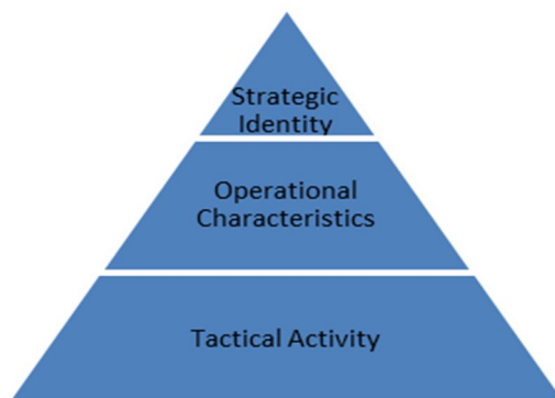
Fig. 1. Levels of CTI

In the vast landscape of digital information, data mining emerges as a powerful tool of CTI. It transforms raw data into actionable insights. By understanding this process, organisations can harness the power of data to predict cyber threats. Cyber security is the major challenge that every organisation faces in this digital age. An endless cyberspace war that is fueled by monetary agendas as well as economic purposes makes organisational information and system resources vulnerable. Examples include customer privacy data, company's commercial secrets, strategic plans, and interruptions of operation information technology.