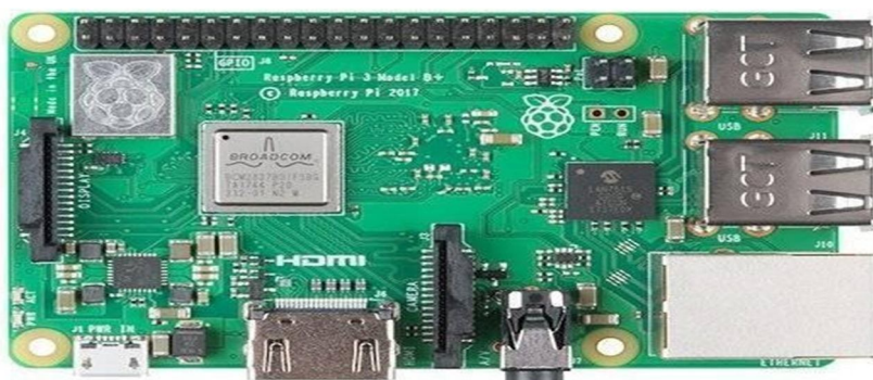
RASPBERRY Pi -3 B+