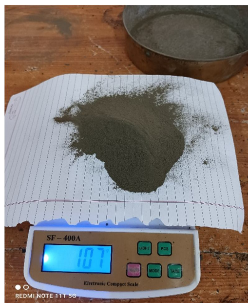
Figure 2. Fractions smaller than 150microns.