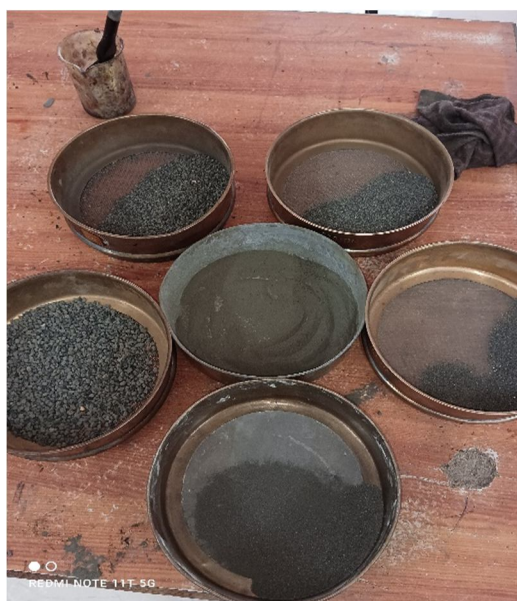
Figure 1. Sieving of Fine Aggregates