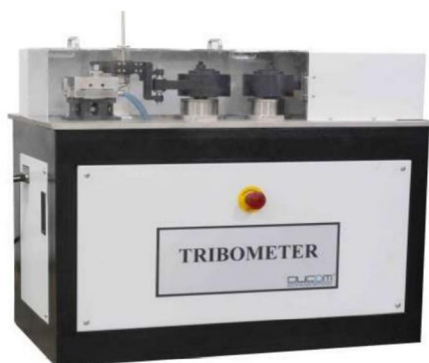
Figure 2 : Tribometer