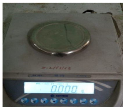
Figure 3: Weighing Scale