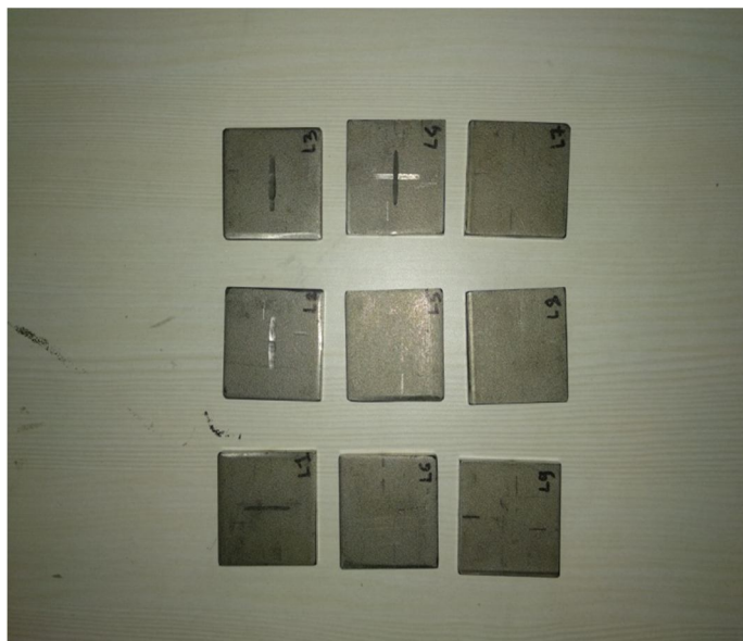
Figure 1. Titanium sample