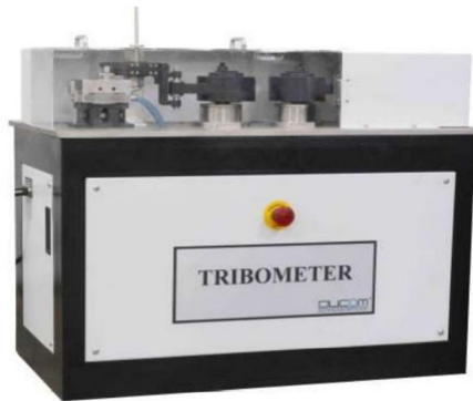
Figure 2 : Tribometer