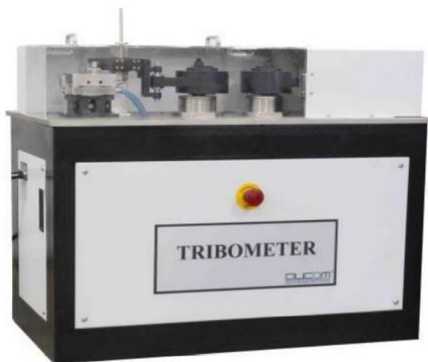
Figure 2 : Tribometer