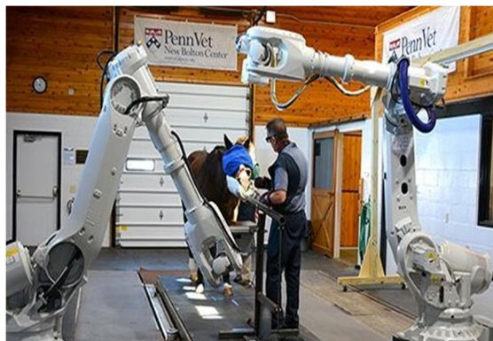
Figure 6.1: Equine imaging system [10]

Penn Vet's New Bolton Center has completed installation of a progressive robotics-controlled imaging gadget for use within the standing and transferring horse. Bolton center veterinarians are growing the application-associated protocols for use of the system with massive animals, in collaboration with four-Dimensional digital Imaging (4DDI), the company at the back of the innovation of the gadget. The gadget is capable of taking pictures the equine anatomy in a way by no means before possible, whilst the horse is wide awake and load-bearing [9] . current computed tomography (CT) systems usually require the horse to be anesthetized, and are restricted to the parts of the animal that fit into the cylindrical machines. The robots can results easily circulate everywhere in the horse in any orientation whilst the pony is standing, so we are able to see many components of the anatomy we've by no means seen in advance and the process may be accomplished easily.