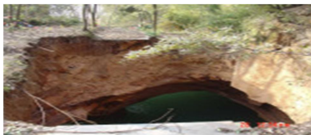
Fig.1. New roof rock collapse with a plane area of 75 m2 of the originally partially failed

However, the safety for people touring the complete caverns is one of the most important things to discuss about because the issues need a pending adequate solutions. The caving would continue to collapse if they are not effectively protected and preserved soon [7][8]. But only when its not disturbed by human beings and strong earthquakes it can maintain it balance. Many people are concerned about stability and the long-term stability of the rock cavern [9][10]. Many incidents happened in different part of the world because of the collapsed of the cave people are injured [11]. It would be extremely sad and sorry if one of the roof collapse with people inside, We do not want to see such disasters to occur although partial failures have occurred to them. Therefore, addressing the issues is significant [12]. It is necessary to investigate the effective and efficient methods to protect and preserve the complete rock cavern.