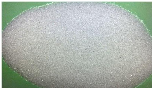
Fig. 5. Glass powder

Glass powder is an extremely fine powder made from ground glass. It can be used in a number of industrial and craft applications and is often available through suppliers of glass and industrial supplies. High precision machining equipment is necessary to prepare it, as it needs to be very uniform, with an even consistency. Costs vary, depending on the level of grind and the applications. The process can involve dry or wet grinding to achieve particles of the desired size. Pigments can be added to make colored glass powders, and companies can also work with colored glass if they want to make powders of a particular color, like blue. The finished product can be hazardous and must be handled with care.