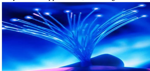
Fig. 4. Optical fibre

An optical fiber is a flexible, transparent fiber made of extruded glass (silica) or plastic, slightly thicker than a human hair. It can function as a wave-guide, or “light pipe”, to transmit light between the two ends of the fiber. The field of applied science and engineering concerned with the design and application of optical fibers is known as fiber optics. Optical fibers are widely used in fiber-optic communications, where they permit transmission over longer distances and at higher bandwidths than wire cables. Fibers are used instead of metal wires because signals travel along them with less loss and are also immune to electromagnetic interference. Fibers are also used for illumination, and are wrapped in bundles so that they may be used to carry images, thus allowing viewing in confined spaces. Specially designed fibers are used for a variety of other applications, including sensors and fiber lasers.