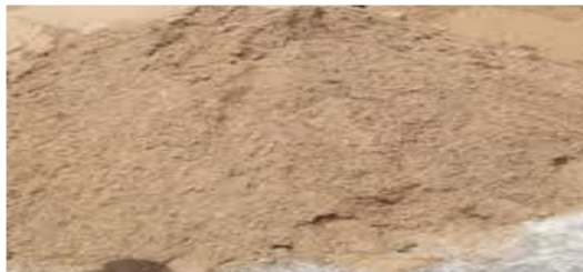
Fig. 3..fine aggregates

Sands are commonly used as fine aggregate. Sand may be either natural or artificial. The fine aggregate fills the voids present in coarse aggregate and minimizes shrinkage of concrete. The size of sand particles should be between 75 micron to 4.75mm.