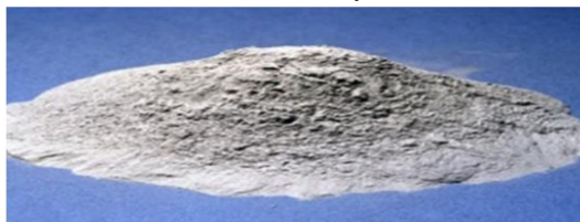
Fig. 2. Cement

Cement is a major ingredient of binding material used in concrete. It provides good adhesive property to bind fine aggregate and course aggregate. The major ingredients of cement is limestone and clay.