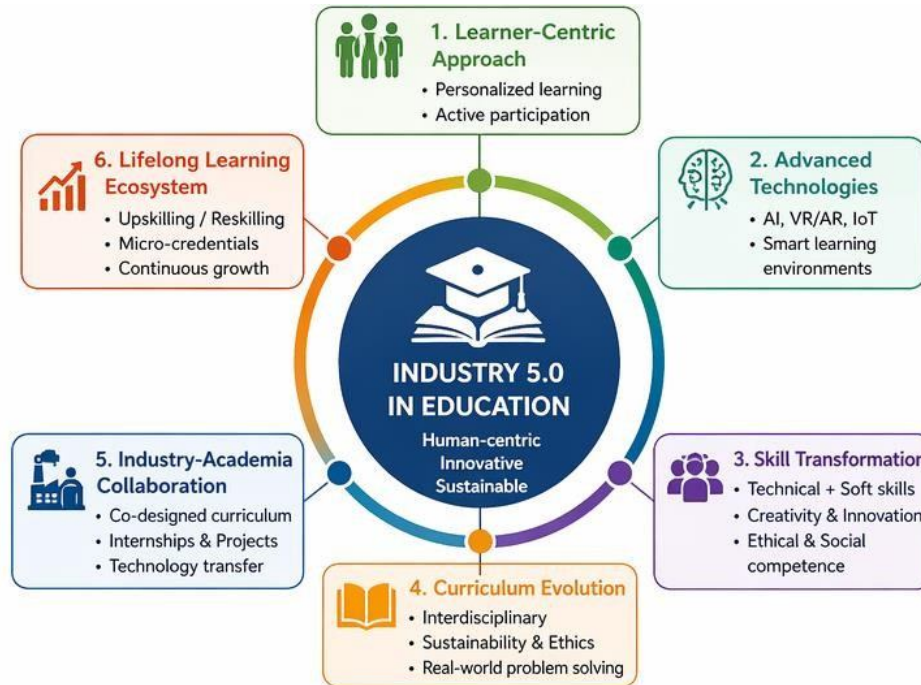
Figure 1. Impact of Industry 5.0 in education - Conceptual Framework.