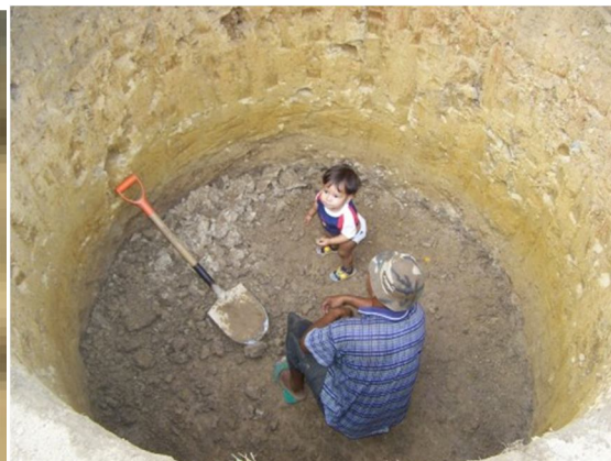
Fig. 4 Dry well