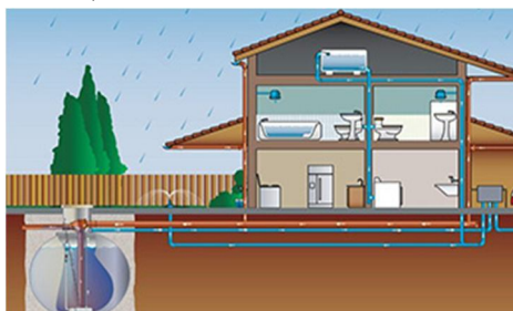
Fig. 1 Rain water harvesting

Rainwater harvesting essentially means collecting rainwater on the roofs of building and storing it underground for later use. Not only does this recharging arrest groundwater depletion, it also raises the declining water table and can help in water supply. Rainwater harvesting and artificial recharging are becoming very important issues. It is essential to stop the decline in ground water levels, i.e. prevent sea water from moving landward, and conserve surface water run-off during the rainy season