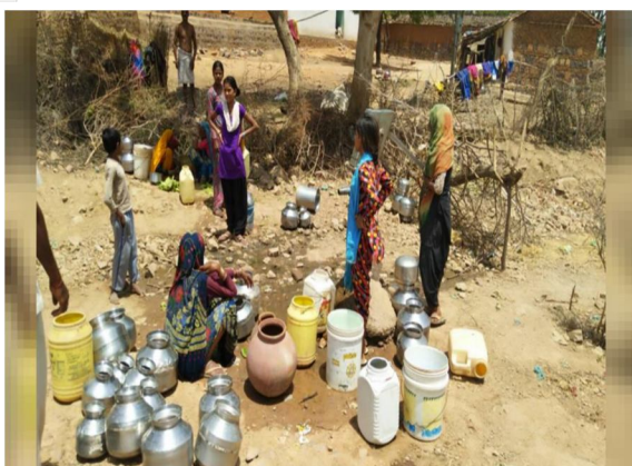
Fig. 3 Water scarcity