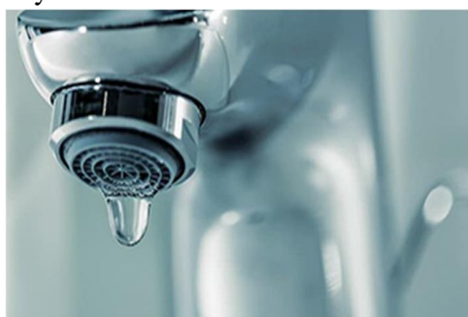
Fig. 2 Water efficient tap

These taps is a simple device which dispenses a limited amount of water slowly and facilitates a thorough hand wash. In case of piped water supply, every time the tap is opened for a hand wash, an average of 300 - 500 ml of water is utilized. Using these Tap it is possible to have a good hand wash with only 60 to 80 ml of water.