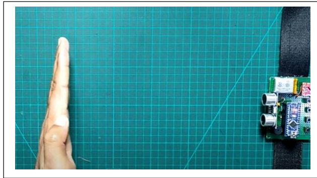
Fig.5.2. Object detection by smart gloves