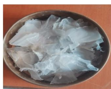
Fig -2: Aggregate

It is estimated that approximately 10 thousand tons per day (TPD) of plastics waste is generated i.e. 9% of 1.20 lacs TPD of MSW in India. The plastic waste constitutes two major categories of plastics; (i) Thermoplastics and (ii) Thermoset plastics. Thermoplastics, constitutes 80% and thermoset constitutes approximately 20% of total postconsumer plastics waste generated in India. The Thermoplastics are recyclable plastics which include; Polyethylene Terephthalate (PET), Low Density Poly Ethylene (LDPE), Poly Vinyl Chloride (PVC), High Density Poly Ethylene (HDPE), Polypropylene (PP), Polystyrene (PS) etc. However, thermoset plastics contains alkyl, epoxy, ester, melamine formaldehyde, phenolic formaldehyde, silicon, urea formaldehyde, polyurethane, metalized and multilayer plastics etc. The use of plastic materials such as carry bags, cups, etc. is constantly increasing.