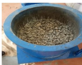
Fig – 3 :Aggregate

Overall, the selection and use of a suitable coarse aggregate is critical to the performance and durability of bituminous roads. It is important to follow the relevant standards and guidelines for aggregate selection and mix design to achieve the best possible results.