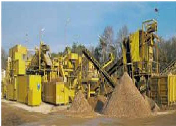
Photo1: Aggregate crushing plant

Recycled aggregates to be produced from aged concrete that has been demolished and removed from foundations, pavements, bridges or buildings, is crushed and processed into various size fractions. Reinforcing steel and other embedded items, if any, are removed and care is taken to prevent contamination by dirt or other waste building materials such as plaster or gypsum. It is prudent to store old concrete separately to other demolition materials to help avoid contamination. Records of the history of the demolition concrete – strength, mix designs etc. – would seldom be available, but if available these are useful in determining the potential of the recycled aggregate concrete.