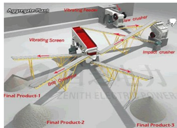
Photo2: Working Sequence of Aggregate crushing plant