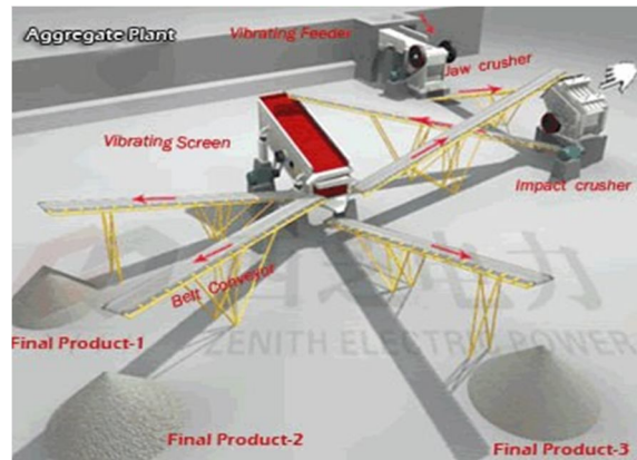
Photo2: Working Sequence of Aggregate crushing plant