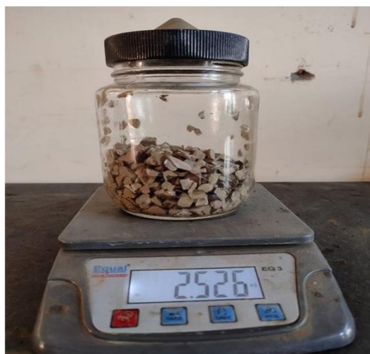
Fig 2.2.2- Specific gravity and water absorption test for tile aggregate.

Three cubes of this concrete were prepared and they have been left for curing period 3, 7 and 14 days.