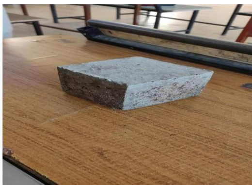
Fig 2.2.1 – Crushed ceramic concrete block.

Once the concrete is ready it was again filled in three layers in 100mmX100mmX100mm mould size.