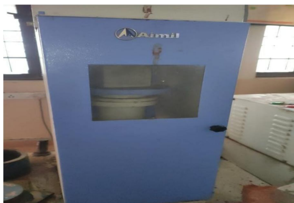
Fig 2.2.3: Compressive strength test of concrete.

As our ceramic aggregate was of size 10mm so the test for specific gravity and water absorption have been performed in the pycnometer. After completion of curing period of 3, 7 and 14 days the cube were tested in UTM (universal testing machine) for the compressive strength test. Results were noted down from the UTM for normal concrete and ceramic waste concrete and the results were compared.