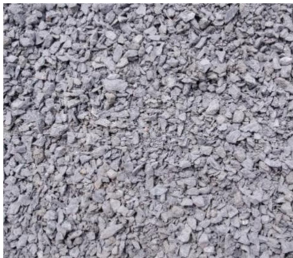
Fig 2.1- Crushed ceramic tiles.

The materials used for concrete production are sand and coarse aggregate sand was sieved from 4.5mm sieve size and coarse aggregate of 15mm to 20mm size were adopted and ordinary Portland cement was used for normal concrete, for ceramic waste aggregate concrete, in place of coarse aggregate the crushed ceramic of size 10mm is used as an aggregate.