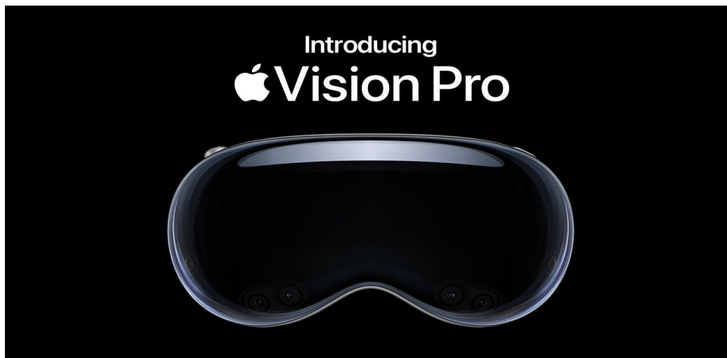
Fig: Apple Vision Pro

In July 2021, CEO of Facebook Mark Zuckerberg announced the creation of the metaverse, following suit to rename his company to Meta. In the months that followed, dozens of major brands (like Microsoft, Disney, Tencent) also announced their entry into this metaverse. The metaverse is a remarkable digital universe accessed via virtual reality, allowing you to mirror many activities from your daily life into a virtual domain. Unlike traditional VR applications, which operate as independent entities, the metaverse weaves all applications and services together, providing a seamless, uninterrupted experience. This fascinating phenomenon is shaping up to be one of the defining VR trends of our time.