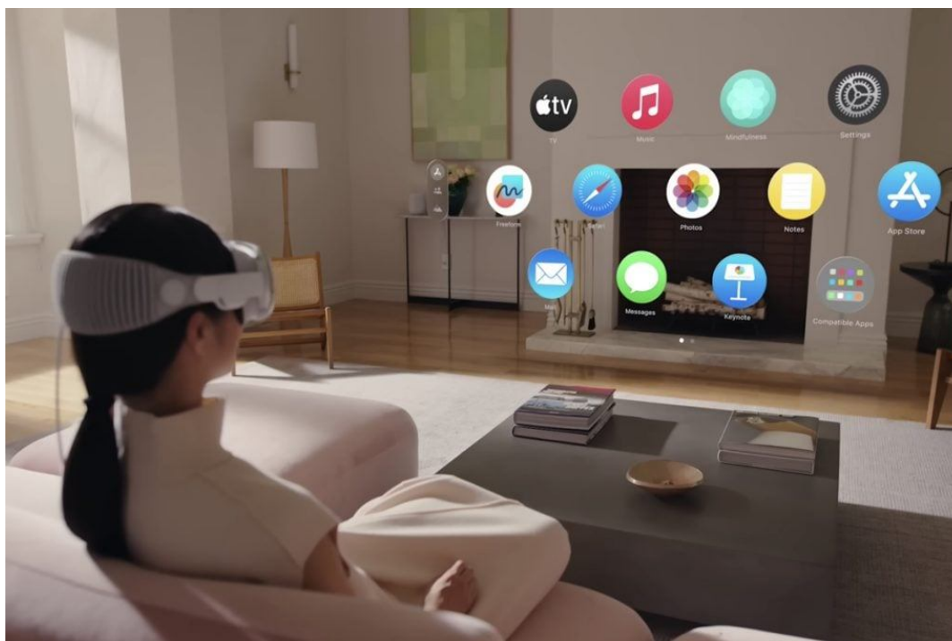
Fig: Apple Vision Pro interface

The future of virtual reality is increasingly leaning towards multisensory experiences. It's not just about what users can see; it's about what they can touch, smell, and even taste. The more realistic the virtual world, the more immersive and captivating the experience for the user.