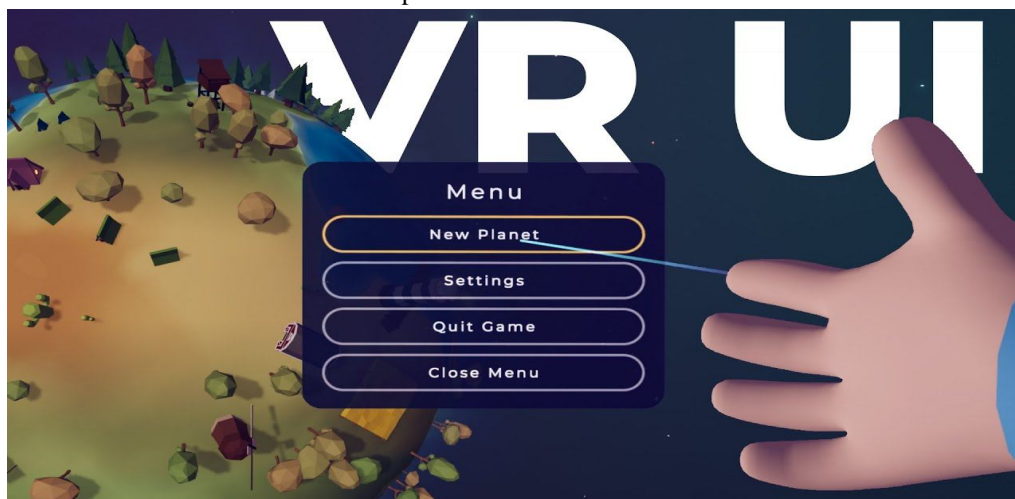
Fig: VR gaming interface