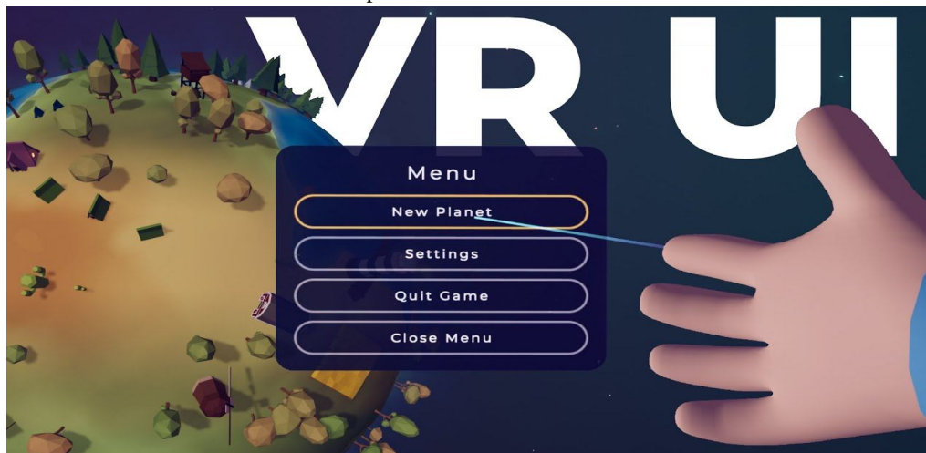
Fig: VR gaming interface