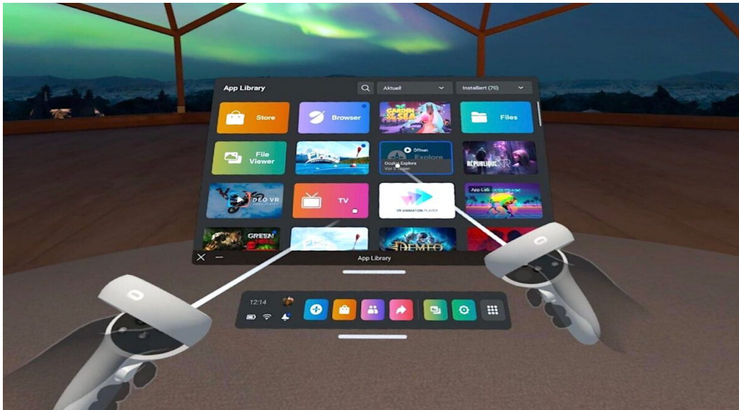
Fig: VR Oculus