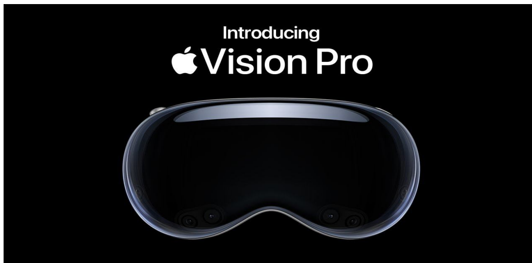
Fig: Apple Vision Pro

In July 2021, CEO of Facebook Mark Zuckerberg announced the creation of the metaverse, following suit to rename his company to Meta. In the months that followed, dozens of major brands (like Microsoft, Disney, Tencent) also announced their entry into this metaverse. The metaverse is a remarkable digital universe accessed via virtual reality, allowing you to mirror many activities from your daily life into a virtual domain. Unlike traditional VR applications, which operate as independent entities, the metaverse weaves all applications and services together, providing a seamless, uninterrupted experience. This fascinating phenomenon is shaping up to be one of the defining VR trends of our time.