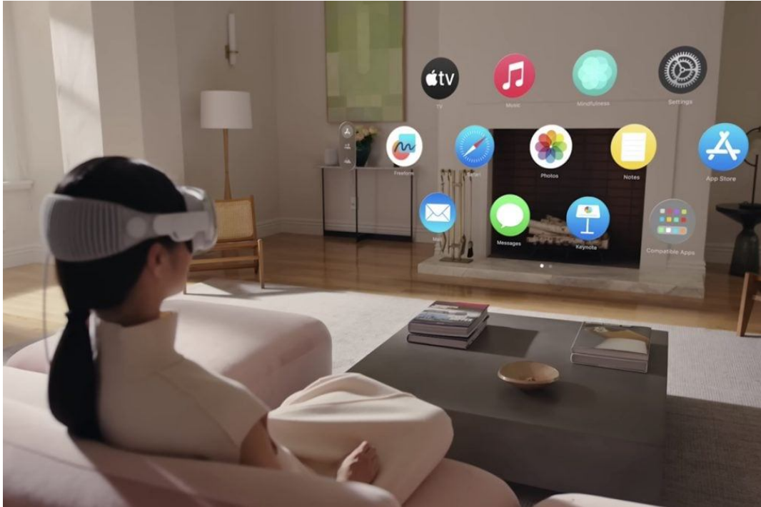
Fig: Apple Vision Pro interface

The future of virtual reality is increasingly leaning towards multisensory experiences. It's not just about what users can see; it's about what they can touch, smell, and even taste. The more realistic the virtual world, the more immersive and captivating the experience for the user.