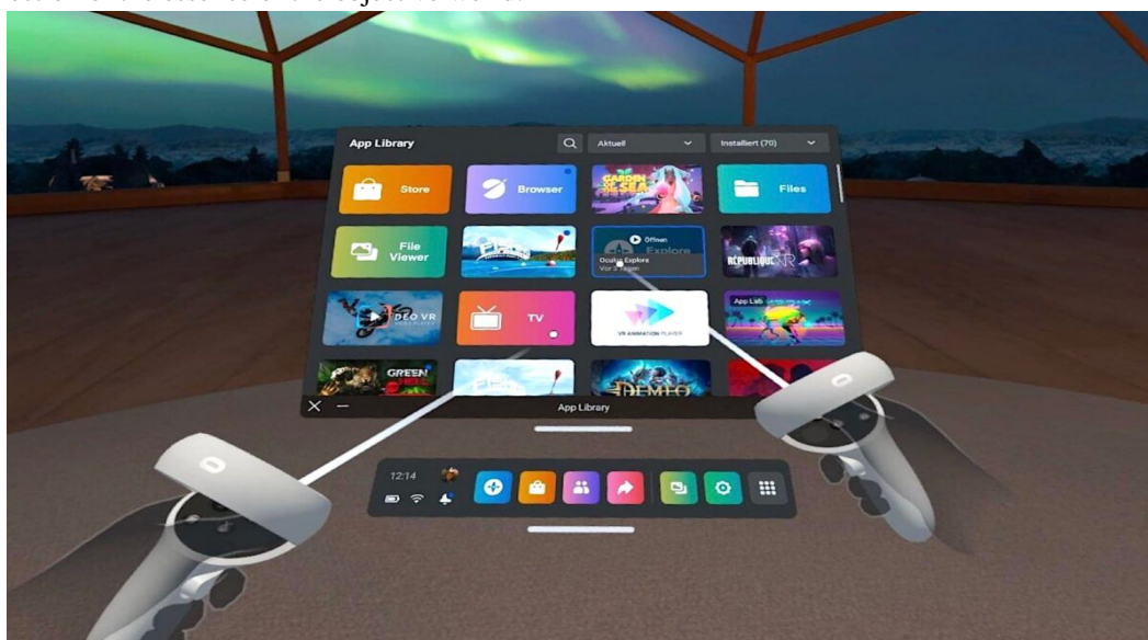
Fig: VR Oculus