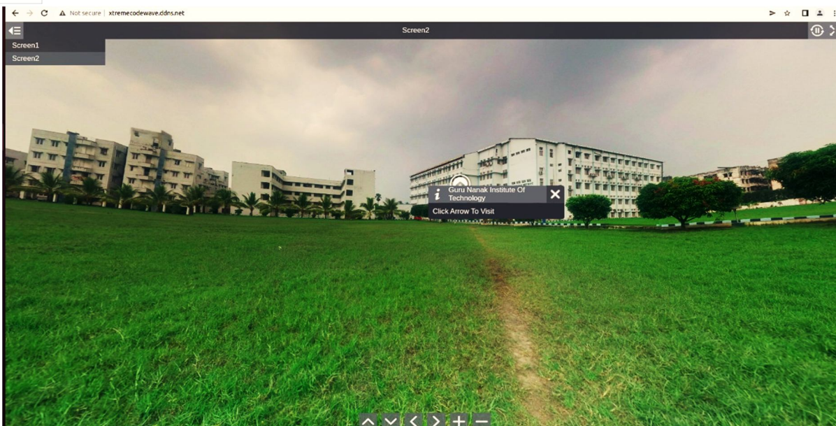
Fig. Screen 2 shows the platform where after clicking a user can enter inside the campus and make a tour as per their need in 360 degree panoramic mode