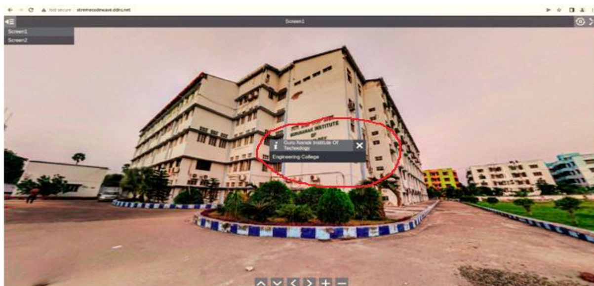
Fig. Screen 1 shows 360 degree panoramic VR view of college campus