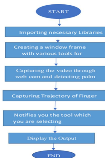
Fig-1 Algorithm Diagram