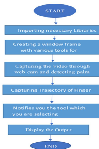
Fig-1 Algorithm Diagram