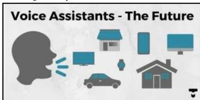
Fig. 2 Voice Controlled Appliances Affecting Our DailyLife

This has been beneficial in daily lifestyle. From cell phones to private pcs to mechanical industries these assistants are in very plenty demand for automating duties and increasing efficiency.