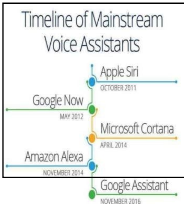
Fig. 1 Timeline of Main Voice Assistants