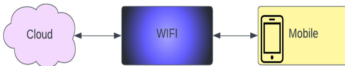
Fig.3 Controlling and Monitoring section

When the current passes in the coil, it creates a sustainable magnetic field that is responsible for the activation of armature, which in turn responsible for the movement of the moving contacts and establishes and disconnects the contacts which are fixed (depending on structure). When the coil is activated with direct current, diodes or resistors are frequently placed in a direction that is crossed to the coil for the dissipation of the energy from the field (magnetic) that decays when we stop the activation. Causes harmful voltage spikes in semiconductor circuit components. In some cases the relay is responsible for driving a large amount or extreme amount of reactive load, where surge currents can occur around the output contacts.