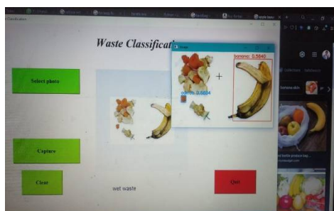
Detection of wet waste using Yolo