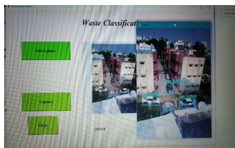
Detection of vehicles using Yolo