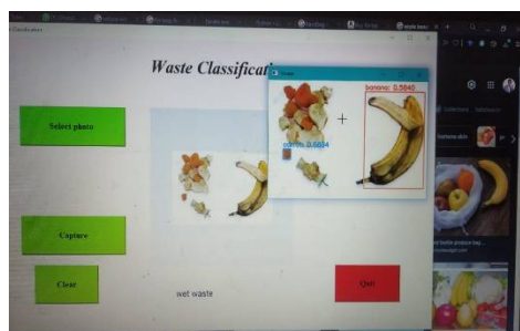
Detection of wet waste using Yolo