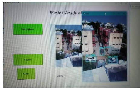
Detection of vehicles using Yolo