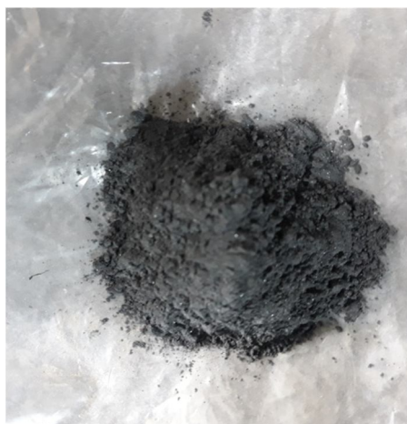
Figure 2 TiO 2