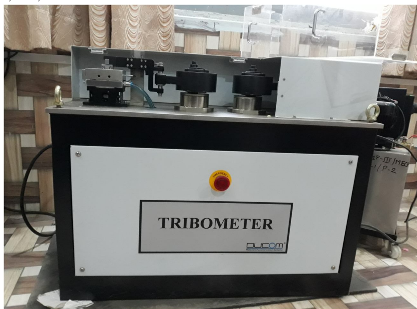
Figure 1. Tribometer Setup

Table 1 states the specification of the Tribometer setup used in this study. All the experiments were conducted Government College of engineering, Aurangabad, M.S, India.