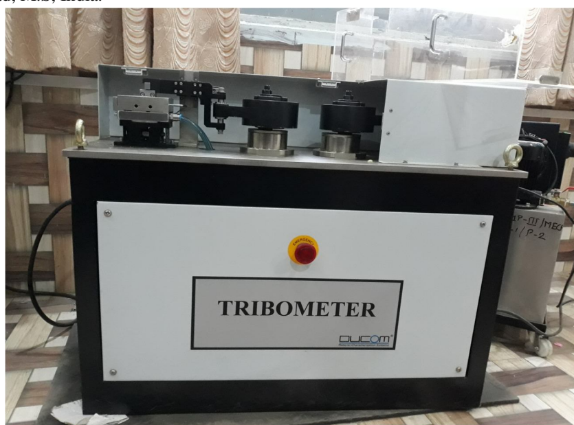
Figure 1. Tribometer Setup

Table 1 states the specification of the Tribometer setup used in this study. All the experiments were conducted Government College of engineering, Aurangabad, M.S, India.