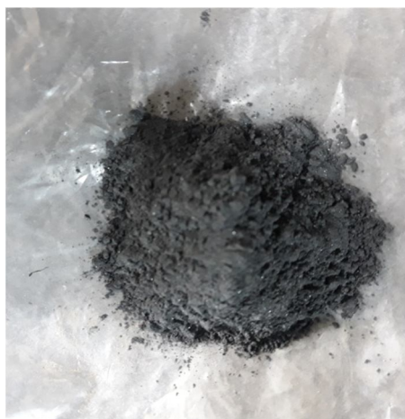
Figure 2 TiO 2

a) Titanium Oxide : Titanium Oxide is better thermal and wears shock resistances. It has good mechanical properties and at high temperature. It provide corrosion resistance and it not solubles in water and diluted acid