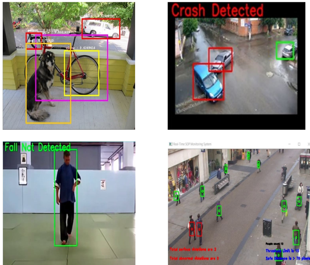
Fig. 1: Images of YOLO Parameters

Additionally, within the domain of intelligent transportation systems, the timely detection of vehicular crashes is imperative for ensuring road safety. Traditional surveillance methods often fall short in providing prompt and accurate detection, prompting the need for innovative approaches. Leveraging deep learning algorithms like YOLO offers a promising solution for real-time vehicular crash detection in smart surveillance systems. By analyzing video streams from traffic cameras, YOLO can swiftly identify and alert authorities to the occurrence of crashes, enabling prompt response and potentially saving lives. In this context, this paper aims to explore the transformative potential of integrating advanced computer vision techniques, particularly YOLO algorithms, across various surveillance applications. By addressing critical concerns in fall detection, social distancing monitoring, metro security, and vehicular crash detection, this research seeks to contribute to the advancement of safety and security measures in both urban and public settings.