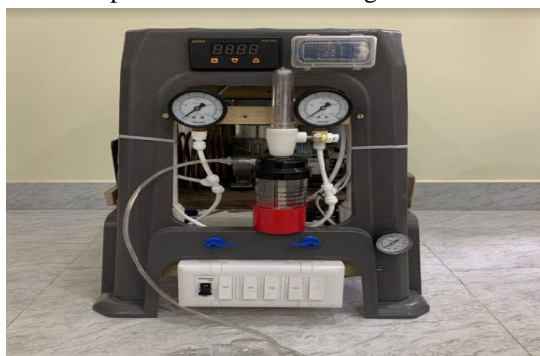
Figure 2: Assembled zeolite based portable oxygen concentrator

The proposed portable oxygen concentrator developed is shown in the image below.