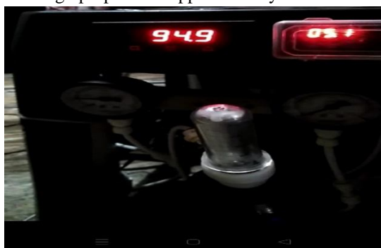
Figure 3 Purity level of oxygen

The purity level of oxygen obtained for the design proposed is approximately 94.9 %