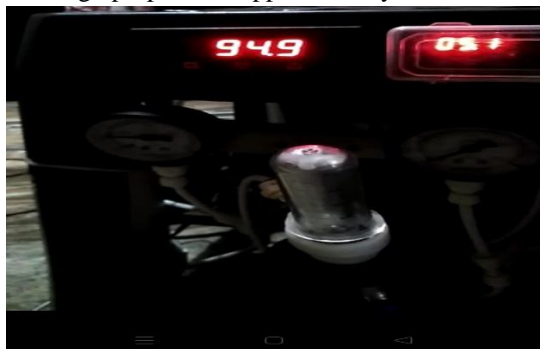
Figure 3 Purity level of oxygen

The purity level of oxygen obtained for the design proposed is approximately 94.9 %