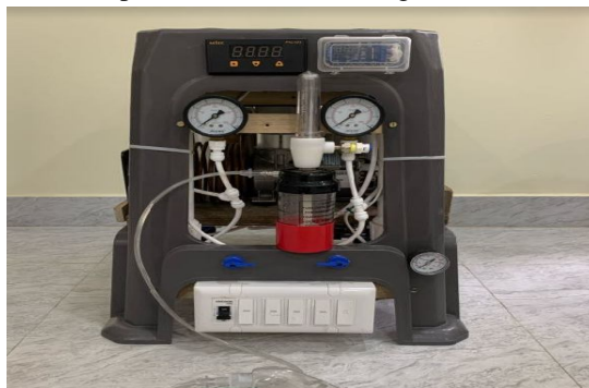
Figure 2: Assembled zeolite based portable oxygen concentrator

The proposed portable oxygen concentrator developed is shown in the image below.