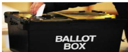
Fig-1: Ballot Box

We used to have a Ballot voting system in the past and it is also being followed in some of the very few places at present. People were provided with a ballot paper containing the list of candidates, their respective party names and symbols. All the voters had to do was to put a swastika symbol of the candidate whom they want to elect. It had many disadvantages. This system was not a secured one. It was also not a cost effective one.