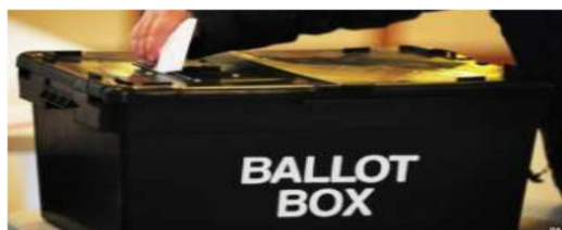
Fig-1: Ballot Box

We used to have a Ballot voting system in the past and it is also being followed in some of the very few places at present. People were provided with a ballot paper containing the list of candidates, their respective party names and symbols. All the voters had to do was to put a swastika symbol of the candidate whom they want to elect. It had many disadvantages. This system was not a secured one. It was also not a cost effective one.