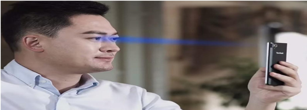
Fig-4: Eye Retina Scanning

The eye retina machine be a simple web cam or device which can capture the images effectively. The capture image will be represented in the form of a matrix where each pixel represents 24-bit (RGB,8+8+8 format).