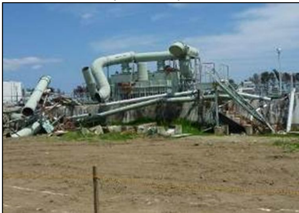
Figure 1: Wastewater Treatment Plant Seriously Damaged by Tohoku Tsunami in the Great East Japan Earthquake 2011.

The field of earthquake resistant design of structure is now a days in limelight the main reason behind this is that no region is now said to be non earthquake zone so the structure need to be designed according to the principle of seismic design of structure. as we are talking about the main structures like buildings nuclear reactors, these structure considered first in the priority for seismic design but as far as liquid retaining structures are concerned they are considered on lower priority then the primary structures. The liquid retaining structures contains sometime water and if this structures are used for environmental aspect then it is used for wastewater treatment plants, as these structures used in wastewater then they contains the untreated sewage and wastewater so if the earthquake will occur then it can damage the underground structure so if the structure will collapse then the water which is untreated in the liquid storage structure will discharge to the environment and that will cost more sufferings to the human as well as the flora and fauna. so it is very important aspect to analyse the liquid storage structures on the basis of seismic analysis so that the earthquake resistant forces is determined and the earthquake resistant design of the structure can be done according to that forces.