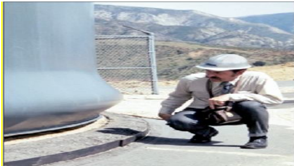
Figure 4: Buckling elephant foot type of tank wall.

In figure no 3 it can be seen that if the earthquake occurs then the liquid that is present in the tank will affect the wall and the liquid creates the sloshing effect on the tank wall which will create damage to the tank wall and these types of sloshing effect is caused by the seismic forces.