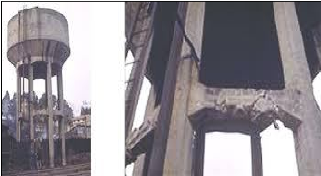
Figure 2: Elevated water tank of PuertoVaras Hotel, May 22nd, 1960.

One of the foremost powerful earthquakes recorded in history caused by the tsunami at the north eastern part of Japan is of magnitude of 9 on richter scale. It affects the 8 million households 270,000 buildings were destroyed. This damage also leads the destruction of water and waste water structures and distribution system.