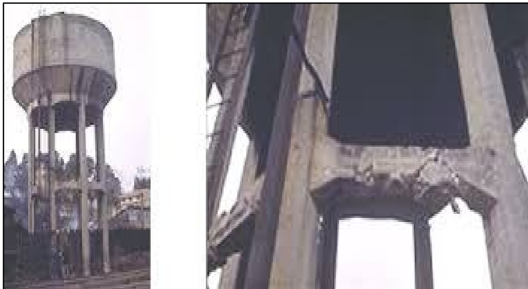
Figure 2: Elevated water tank of PuertoVaras Hotel, May 22nd, 1960.

One of the foremost powerful earthquakes recorded in history caused by the tsunami at the north eastern part of Japan is of magnitude of 9 on richter scale. It affects the 8 million households 270,000 buildings were destroyed. This damage also leads the destruction of water and waste water structures and distribution system.