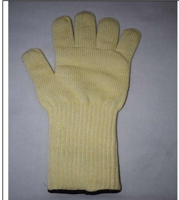
Figure 1: Para-aramid with E-glass gloves samples

Commercially available washing detergent i.e. Tide® was used for washing.