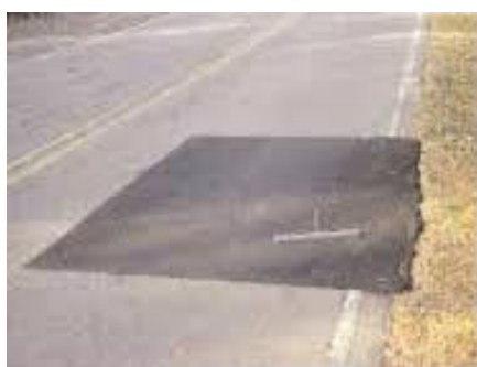
Figure 2 Typical Patched Surface

Normally the pavement will be patched with fresh materials to remove the potholes from the pavement surface. The area of newly laid materials is measured in m^2 . The area of patching performs better but still the area is considered as a defect even though the performance is better it is measured and recorded as a distress parameter. For ease of measurement the area was measured either as a square or a rectangle or as a simple triangle in m^2 and expressed as percent area of cracked to total area of pavement.