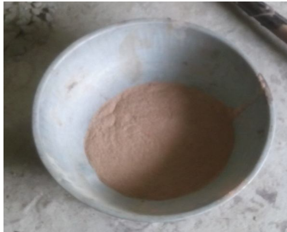
Fig.1 Ceramic tile powder

The ceramic powder is obtained from the industrial by-products or as the solid waste dumped in any major city. As the ceramic in landfill it takes thousands of years to degrade and cause land pollution. So some of the not recycled ceramic can be converted into ceramic powder and used as cement replacement. The usage of ceramic in the form of powder is better than using it as fine or coarse aggregate. The tile dust is obtained from RAK ceramics. The specific gravity of tile dust is found to be 2.62 and the fineness is found to be 7.5%.