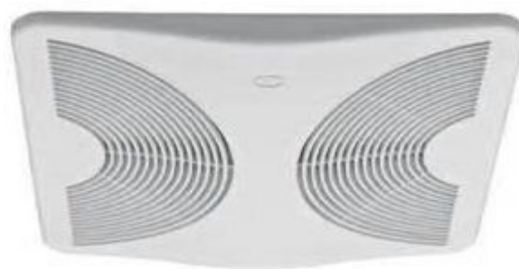
Fig. 4. High efficiency ceiling fans with CFLs

1) Description: Ceiling fans improves interior comfort by circulating cold and warm air. They can be adjusted to either draw warm air upward during summer months or push it downwards in winters. high efficiency ceiling fans with CFLs works very efficiently in less consumption of energy as compaired to conventional ceiling fans.