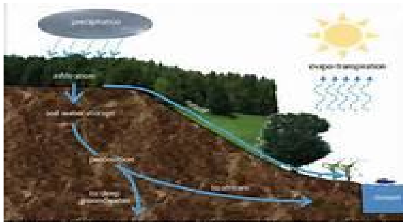
Figure 5.8. The rate of precipitation at the land surface determines whether water infiltrates or runs off the surface.

1) Description: Infiltration practices use temporary surface or underground storage to allow incoming stormwater runoff to exfiltrate in to underlying soils. Runoff first passes through multipul pretreatment mechanisms to trap sediment and organic matter it reaches to the practices. As storm water will reach to the sub soil. It have capability reduction in filtration Expanding foam and caulk are used to prevent infiltration where wood connections are made or framing is drilled to provide plumbing and electric runs.