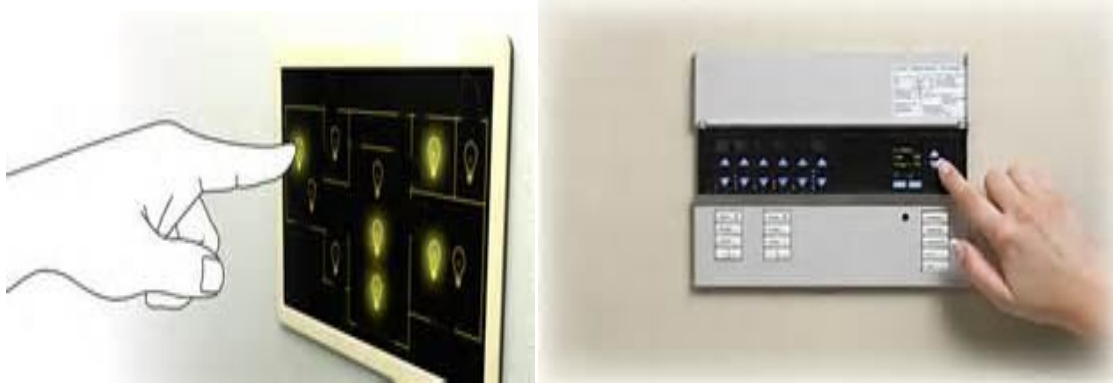
Fig. 3. Lighting control system

Lighting control systems are widely used on both indoor and outdoor lighting of commercial, industrial, and residential spaces. Lighting control systems serve to provide the right amount of light where and when it is needed. Lighting control systems are employed to maximize the energy savings from the lighting system, satisfy building codes, or comply with green building and energy conservation programs. Lighting control systems are often referred to under the term Smart Lighting. Lighting control use dimmers, sensor and timers to turn lights off in unused areas or during times when lighting is not needed.