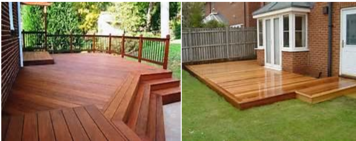
Fig. 1 Wood Decking.

a) Description: In architecture, a deck is a flat surface capable of supporting weight, similar to a floor, but typically constructed outdoors, often elevated from the ground, and usually connected to a building. The term is a generalization of decks as found on ships. There are two types of recycled wood decking, plastic lumber and composite lumber. Plastic lumbars are made-up of only recycled plastic raisins but composite lumber consist of recycled plastic raisins and recycled wood fibers. FSC certified sustainably harvested lumber comes from forests managed in an environmentally and socially responsible manner.