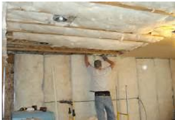
Fig. 6 Ceiling insulation

b) Ceiling insulation: Ceiling and reduced negative environmental impact. It improved thermal performance of buildings, lower energy consumption ultimately money savings and thus less harmful gases emitted into the atmosphere. The buildings can maintain a constant temperature throughout the year, the less energy you will have to waste on additionally cooling or heating the space. Ceilings are under the direct influence of the weather conditions including rain and all the water that can build up it takes care of moisture problems. Ceiling insulation will take care of the moisture problems from that point on, since it will keep the house protected from mould and mildew by allowing all the excessive moisture to escape out, instead of building up underneath the roof. It is generally installed intended to be in ceiling below attic space, with appropriate ventilation.