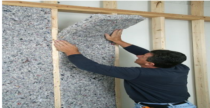
Fig. 5 Wall insulation

a) Wall insulation: Insulate walls of existing wood frame houses to the capacity of the wall cavity; it reduces the temperature by 20 % than external.