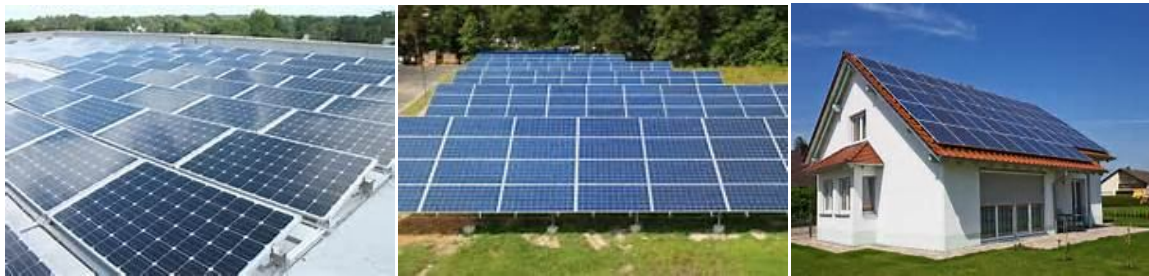
Fig. 9 A photovoltaic system