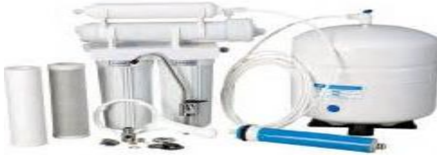
Fig. 2 Water filtration units.

Filters use sieving, adsorption, ion exchanges and other processes to remove unwanted substances from water. Unlike a sieve or screen, a filter can potentially remove particles much smaller than the holes through which its water passes.