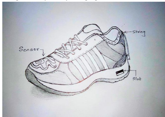
Fig. 1 Sketch of Water Sensing Shoes

This decade is a smart products decade. Our mobiles, watches, TV etc. are becoming smarter with advancement and new ideas. What exactly our paper aims at? We propose innovative shoes which are water sensitive and thus help in solving the problem of water entering the shoes from its rim during rains. For this purpose it uses a copper clad as a sensor which indirectly controls the motor. Everyone need to carry mobile with them and so it need to be charged all the time. It has become a necessity. It also has a special feature of mobile charging slot. Mobile charging can be done by hanging the mobile in mobile holder which will be attached to user's leg and the mobile can be connected to charging slot using USB. So this product can be a very useful thing for people who do trekking in rainy areas where there is no possibility of any charging slot.