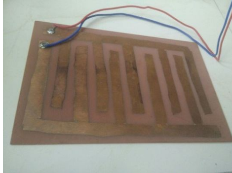
Fig.4 Copper Clad as a Sensor