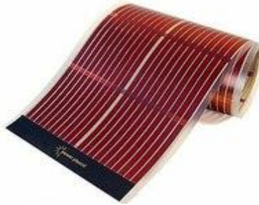
Fig. 1 Printable Solar Cell