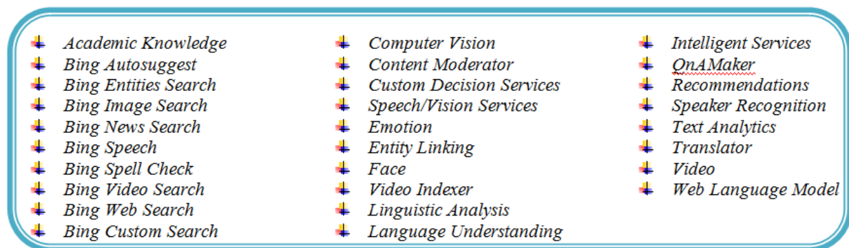
Figure 1: Various API by Microsoft

Cognitive Services include various APIs, SDKs and services for the software developers to develop applications to display not only intelligence but also discoverable. Cognitive Services permit developers to embed intelligent features of emotions, recognition of voice/face/video and also embed understanding of it within their applications. They aim to enhance the computing speed and provide productivity through systems that can generate results for what we see, hear and speak i.e. they can now understand and reason. Microsoft Project Oxford is the case taken in this paper. It includes API and SDK for services like: