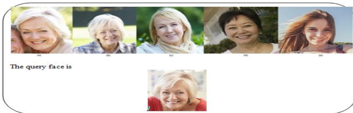
Figure 3: Similarity index of faces: Depicting from (a),(b),(c),(d),(e).