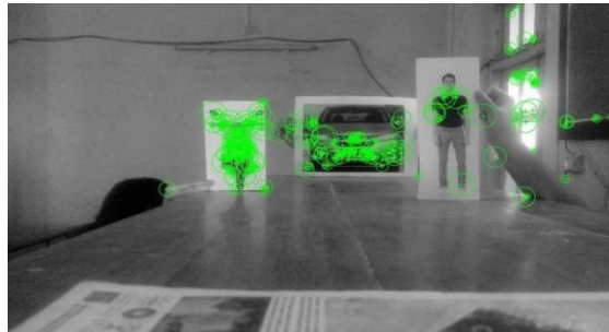
Figure 2 Strongest SURF features detected from scene image

Object detection- [5] Surf features are used to detect the object.