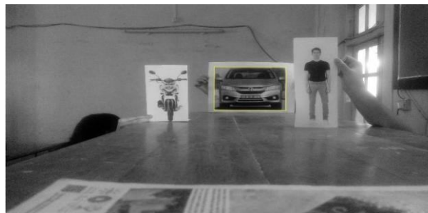
Figure 4 Detected object is shown encircle by a box

Figure 3 [15] SURF features of box image of car had higher match with scene image features, as compared to the box image features of two wheeler or truck. Hence car was detected at the region with the highest matching of SURF features.