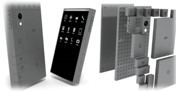
Figure 1: Pictorial representation of a modular smartphone

Technology has always upgraded itself from the time of its inception. The first smartphone was made available to the public in 1994. Thereafter, the concept of smartphone skyrocketed over the whole world leading to what is now known as a modular concept of a smartphone. It is estimated by global agencies report that E-wastewill increase by 33% in 2017.A large section of E-waste mainly consist of mobile phones. Modular smartphone is one of the solutions for this global problem.As consumers, we are already used to customizing our phones, whether it's downloading apps according to our lifestyle, or picking out cases based on our sense of style. The concept of modular smartphones takes us several steps further, allowing us to essentially build your own phone, picking and choosing the hardware pieces we want. A modular smartphone is built using different components that can be independently upgraded or replaced in a modular design.