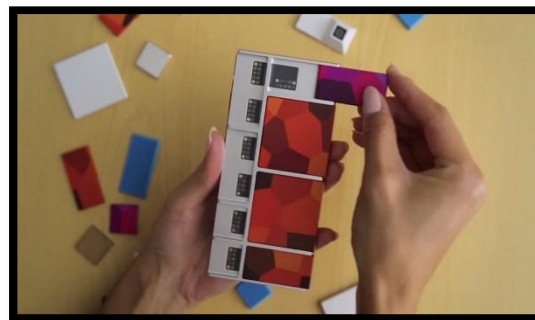
Figure 2: Project Ara modular smartphone prototype

Basically to make a Modular Phone we need a Frame which will hold all parts together. Also we need different modules of camera, SIM card and memory slot, Bluetooth modules, battery, processor chip etc.