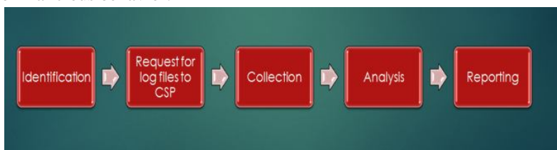
Fig.3 Flowchart for proposed model

The idea of the proposed model is that the CSP stores snapshots of a VM whose activities are identified as malicious by an intrusion detection system. Simultaneously the CSP should be requested for log files of the suspected VM and the investigator collects and processes the log files to obtain the evidence. To collect proper and correct evidence, the suspected VM should be monitored for some more time after it is identified to be performing malicious activities. The more time the suspected VM is monitored the more it can be sure of the possibility of malicious behavior.